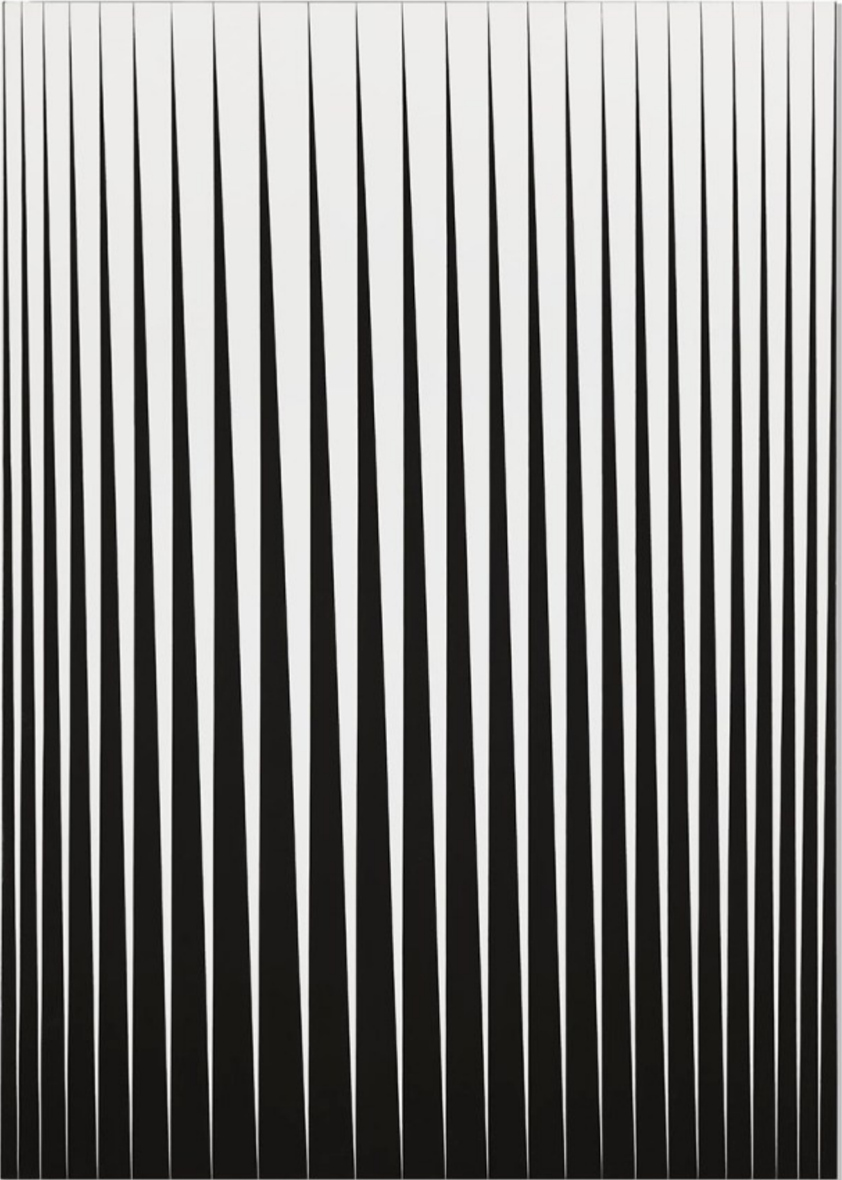
Bridget Riley, Breathe (1966).