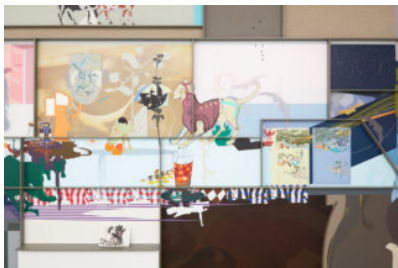
Helen Marten, The Gnocchi of Autumn [detail] (2019) © Helen Marten, courtesy Sadie Coles HQ, London.