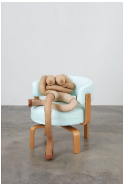
Sarah Lucas, CROSS DORIS (2019)