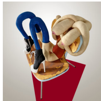
Sarah Lucas, COOL CHICK BABY (2020)