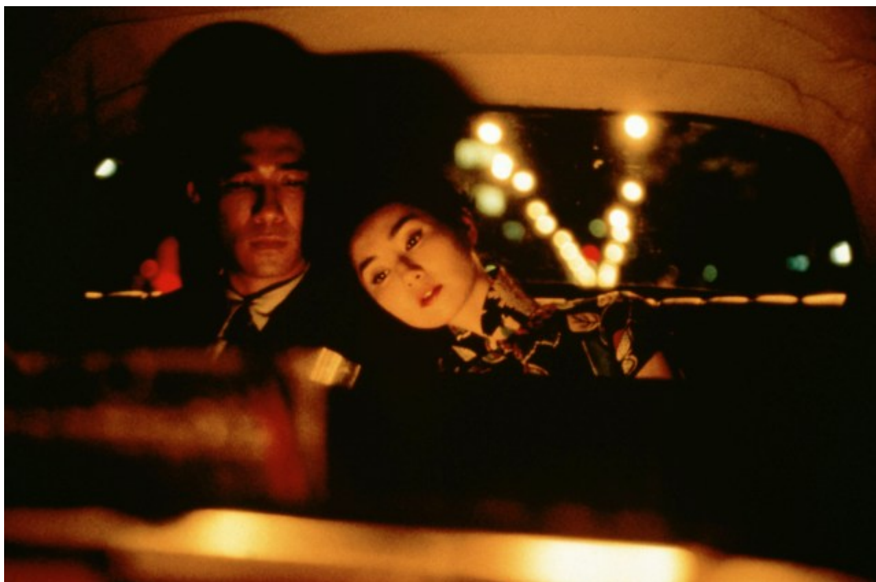
Still from Wong Kar-Wai In The Mood For Love (2000).