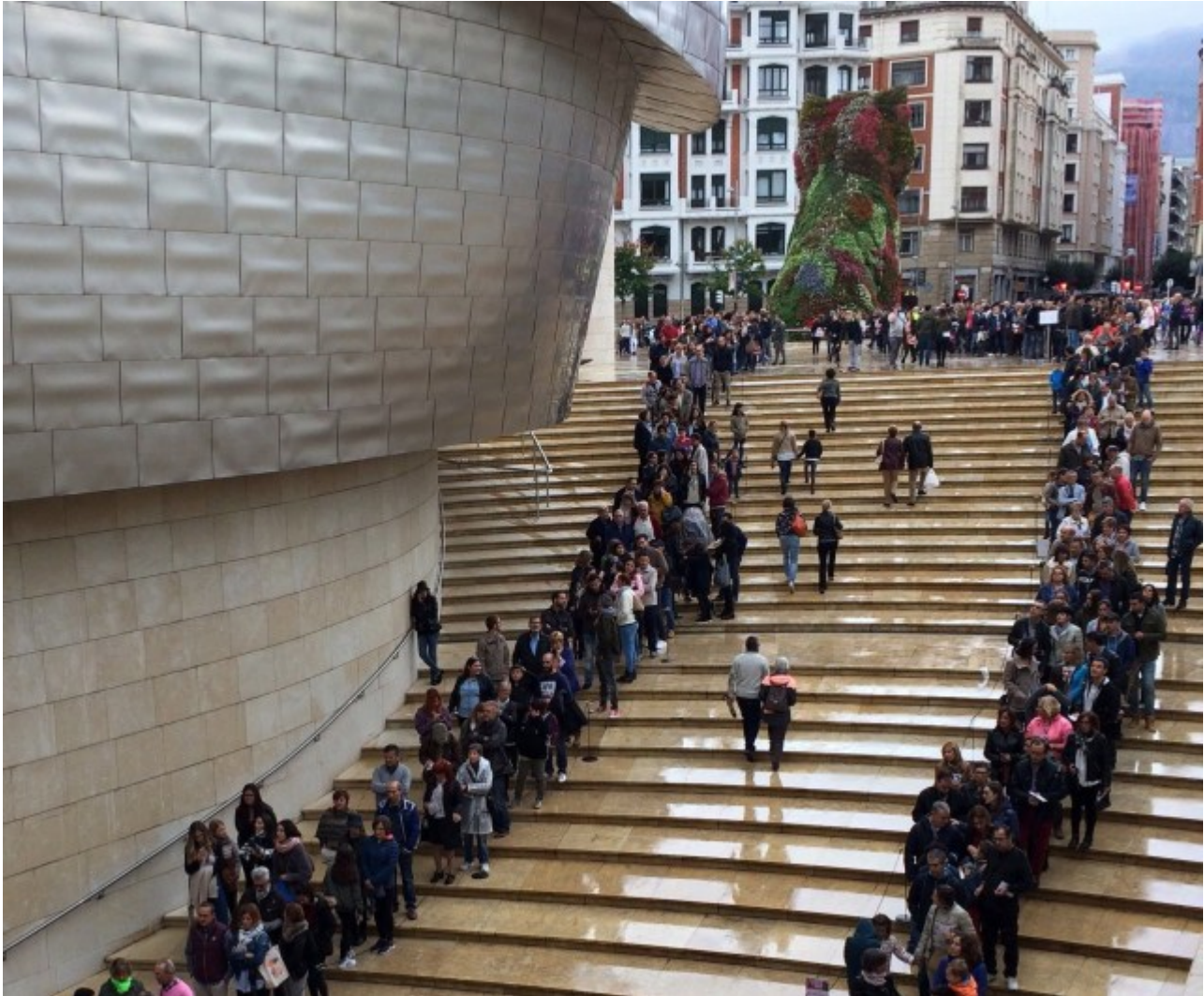
People waiting in line to enter the Guggenheim in Bilbao, Spain.