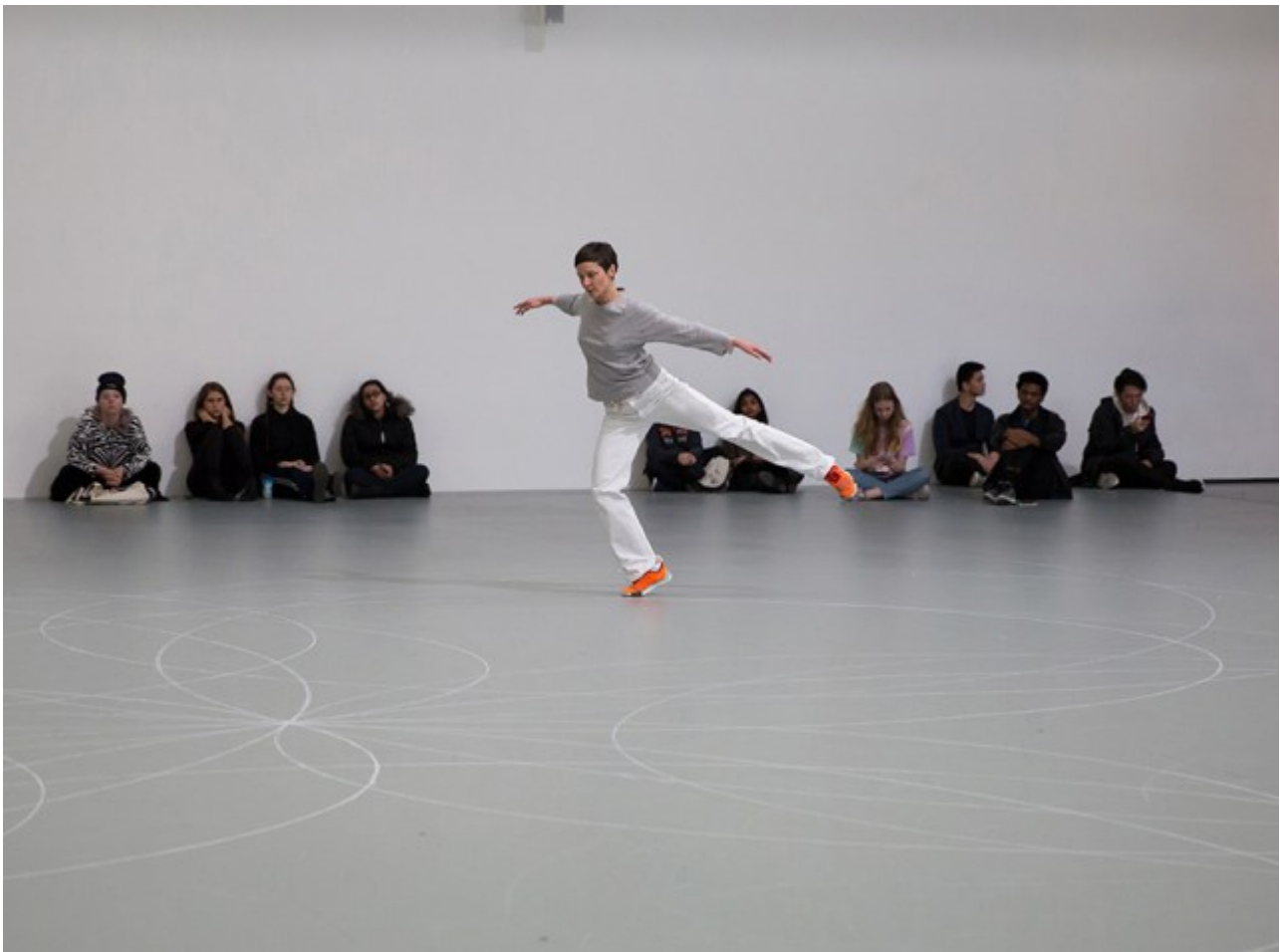
Installation view of Anne Teresa De Keersmaeker. Work/Travail/Arbeid (2015), The Museum of Modern Art, March 29, 2017. © 2017 Anne Teresa De Keersmaeker.