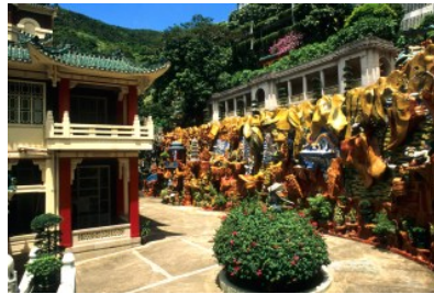
Tiger Balm Gardens, demolished in 2004 for redevelopment.