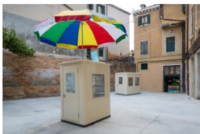
Installation view of Lee Kit, 'You, (you)' representing Hong Kong at the 55th Venice Biennial