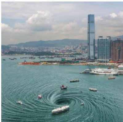
Tommy Fung, Let's add a little drama to the ferry ride across Victoria Harbor (2017)