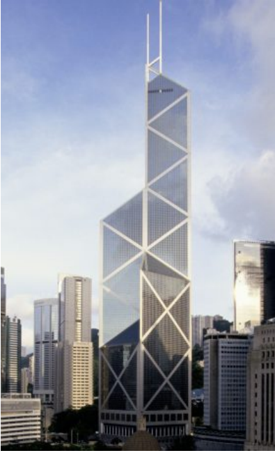
Bank of China in Hong Kong