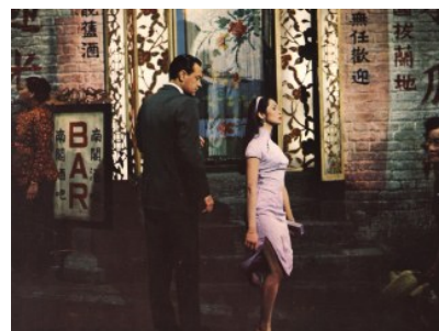
Still from Richard Quine, The World of Suzie Wong (1960)