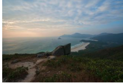
Tai Long Wan (Big Wave Bay) beach, seen from the Sharp Peak trail, Hong Kong