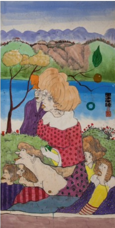
Luis Chan, Dreaming Among Green Hills (1984)