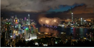
Fireworks on the Victoria Harbor celebrate the anniversary of Hong Kong reunification to China (1 July 2012)