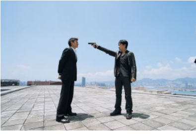
Still from Wai Keung (Andy) Lau and Tony Leung, Infernal Affairs (2002)