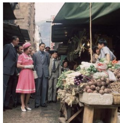
Queen Elizabeth's visit to Hong Kong in 1975