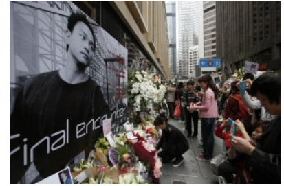
A fan places flowers for the late Hong Kong actor-singer Leslie Cheung outside the hotel where Cheung jumped to his death in 2003