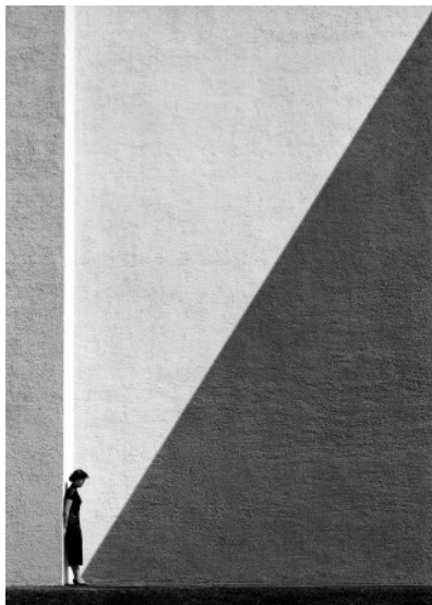
Fan Ho, Approaching Shadow (1954)