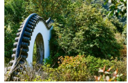
As an alternative to hiking, visit Kadoorie Farm and Botanic Garden