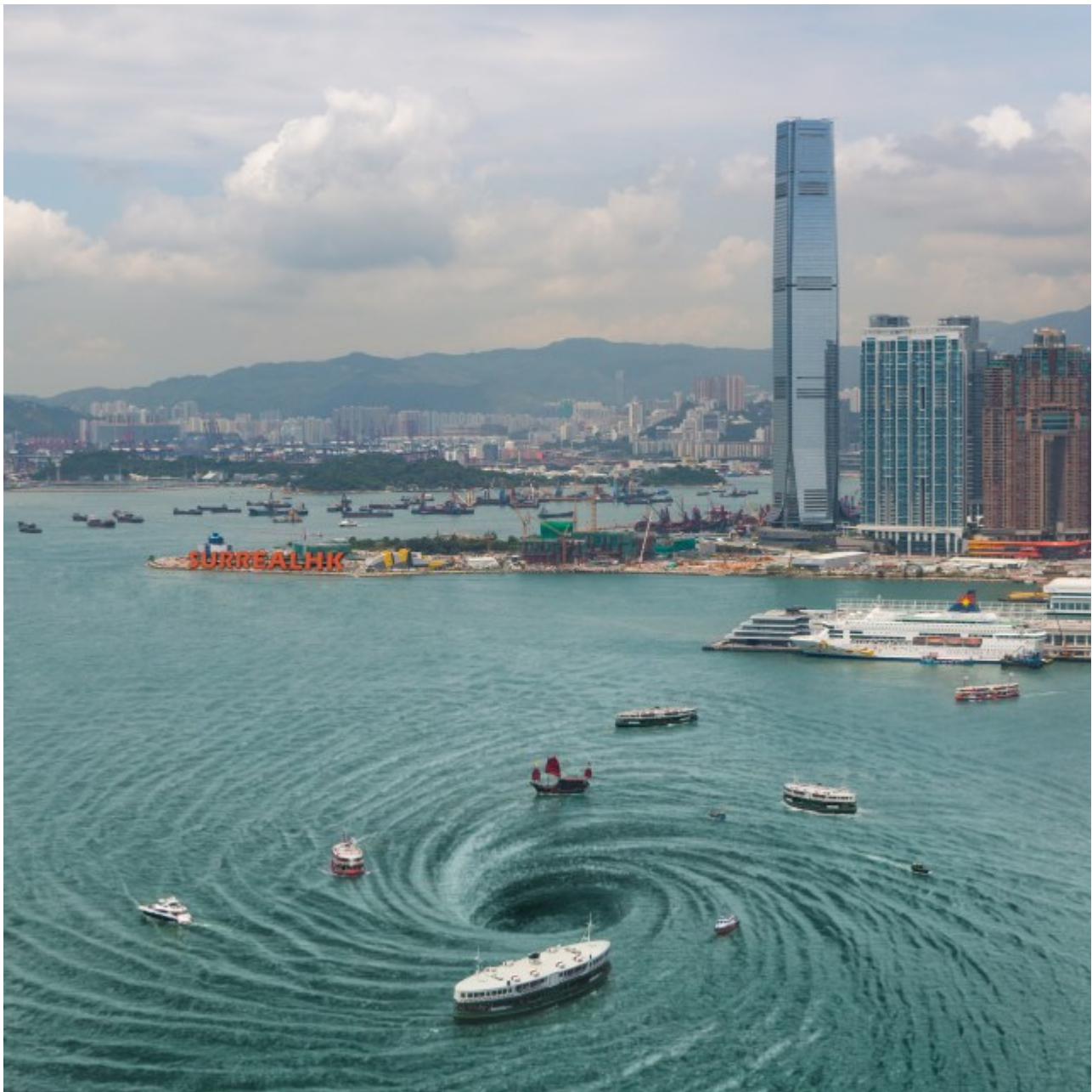
Tommy Fung, Let's add a little drama to the ferry ride across Victoria Harbor (2017)