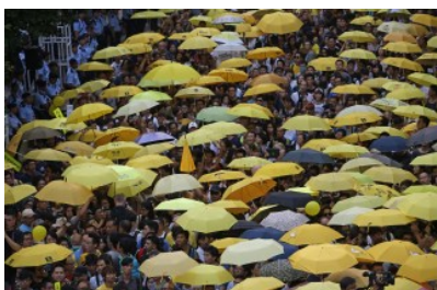
Protesters holding yellow umbrellas gather to mark the first anniversary of the "Umbrella Movement" when students and activists occupied the streets for 79 days to voice opposition against Beijing's plan to restrict Hong Kong's elections