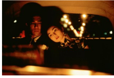
Still from Wong Kar-Wai In The Mood For Love (2000)