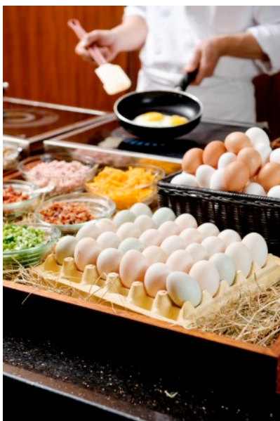
Mandarin Oriental Hong Kong Hotel's Clipper Lounge Breakfast