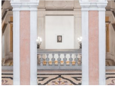
Luc Tuymans, Secrets (1990) at the Palazzo Grassi