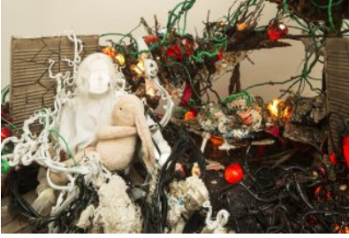
Korakrit Arunanondchai, with history in a room filled with people with funny names 4 (garden) (2019) in the Giardini