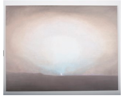
Luc Tuymans, Sundown (2009) at the Palazzo Grassi