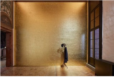
Jannis Kounellis, Untitled (Tragedia civile) (1975) at the Fondazione Prada