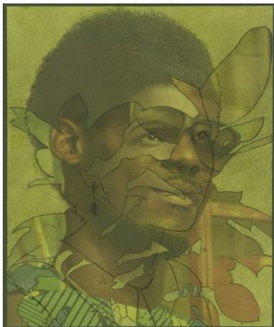
Njideka Akunyili Crosby, Smooth and Good (2019) in the Arsenale