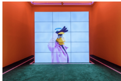
Alex Da Corte, Rubber Pencil Devil (2019) in the Arsenale