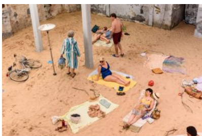
The Lithuanian Pavilion at the Venice Biennale