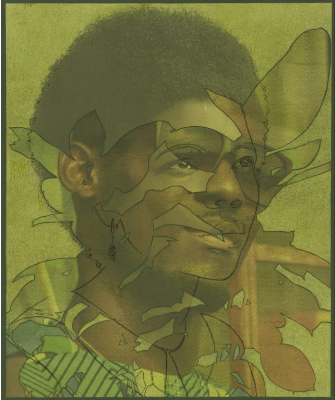
Njideka Akunyili Crosby, Smooth and Good (2019) in the Arsenale