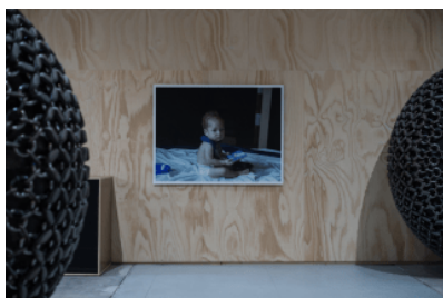
Arthur Jafa's work in the Arsenale