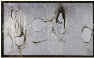
Alberto Burri, Plastica (1964) at the Fondazione Palazzo Albizzini