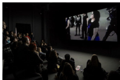
Arthur Jafa, The White Album (2019) in the Giardini