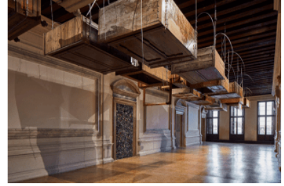
Jannis Kounellis, Untitled (1993-2008) at the Fondazione Prada