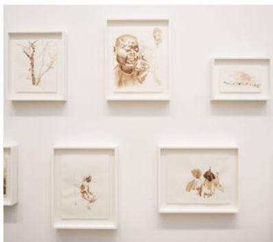
Michael Armitage, Untitled (2017-2019) in the Giardini