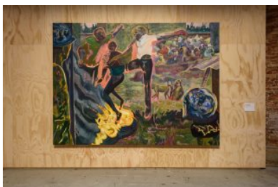
Michael Armitage's work in the Arsenale