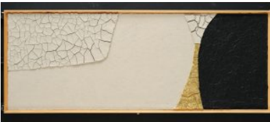
Alberto Burri, Cretto Nero e Oro (1994) at the Fondazione Palazzo Albizzini