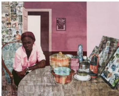
Njideka Akunyili Crosby, Mama, Mummy and Mamma (Predecessors #2) (2014) in the Giardini