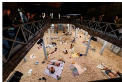
The Lithuanian Pavilion at the Venice Biennale