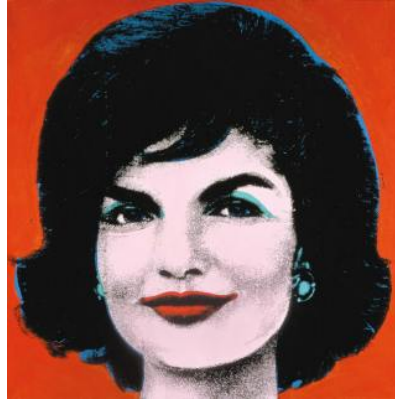
Andy Warhol, Red Jackie (1964)