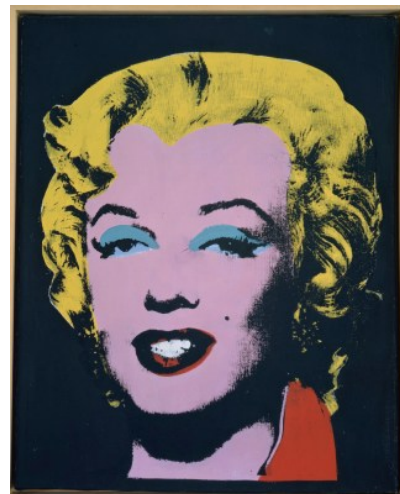
Andy Warhol, Licorice Marilyn (1962)