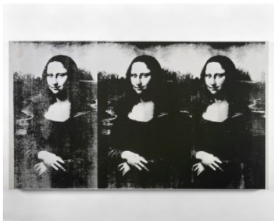
Andy Warhol, Triple Mona Lisa (1963)