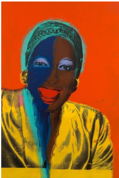
Andy Warhol, Ladies and Gentlemen (c. 1974-1975)