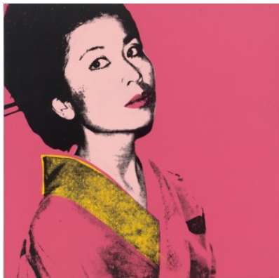
Andy Warhol, Kimiko Powers (1972)