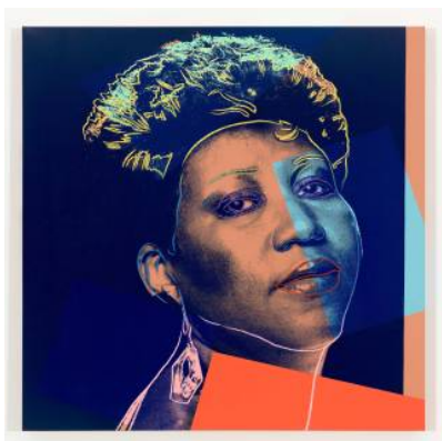
Andy Warhol, Aretha Franklin (1986)