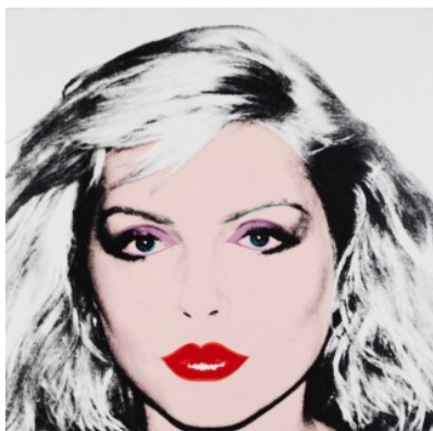
Andy Warhol, Debbie Harry (1980)