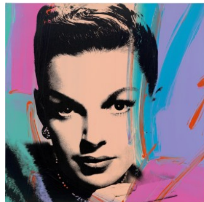
Andy Warhol, Judy Garland (Multicolor) (1978)