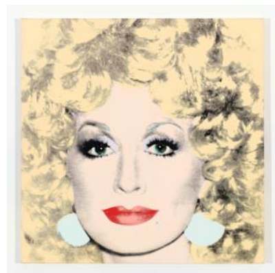
Andy Warhol, Dolly Parton (1985)