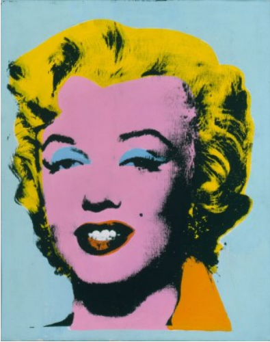
Andy Warhol, Mint Marilyn (1962)