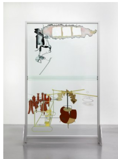
Marcel Duchamp, The Bride Stripped Bare by her Bachelors, Even (The Large Glass) (1915-23)