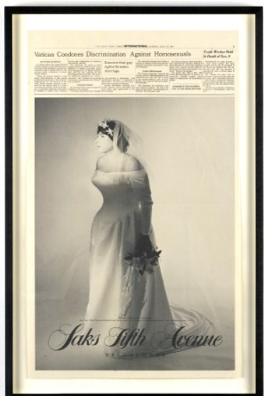
Robert Gober, Untitled (1992-96)