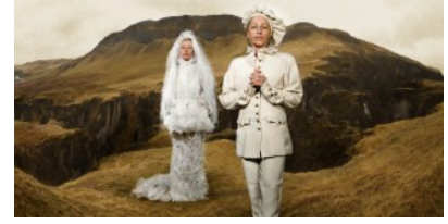
Cindy Sherman, Untitled #548 (2010/2012)