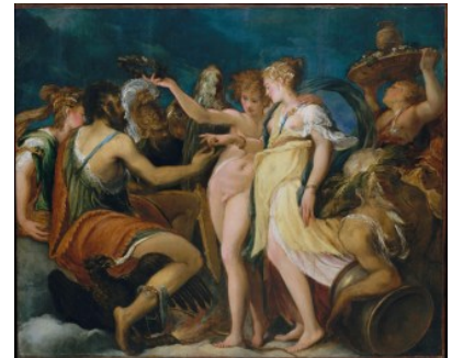
Andrea Schiavone, The Marriage of Cupid and Psyche (c.1550)