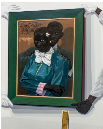
Kerry James Marshall, Still Life with Wedding Portrait (2015)