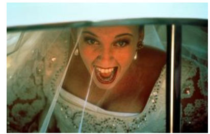
Still from Muriel's Wedding ( 1994)