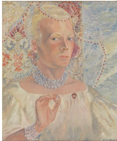
Sylvia Sleigh, The Bride (Lawrence Alloway) (1949)