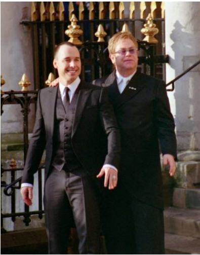
Elton John and David Furnish after their civil partnership ceremony in Windsor Guildhall