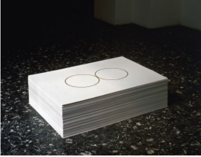
Felix Gonzalez-Torres, Untitled (Double Portrait) (1991)