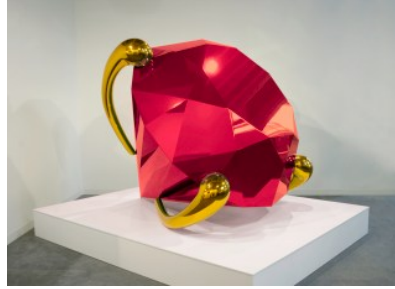
Jeff Koons, Diamond (Red) (1994–2005)