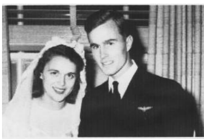
Barbara Pierce Bush and former US President George HW Bush at their wedding in 1945