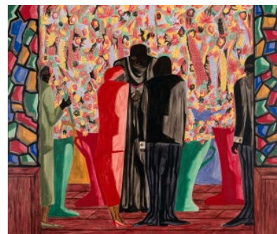
Jacob Lawrence, The Wedding (1948)