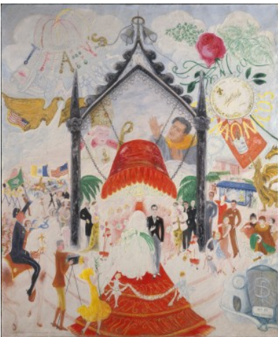
Florine Stettheimer, The Cathedrals of Fifth Avenue (1931)