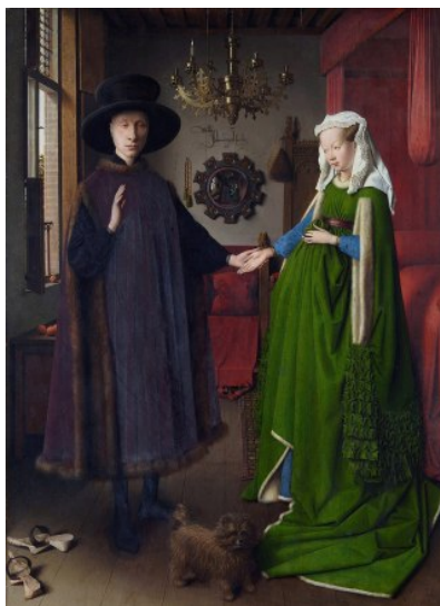
Jan Van Eyck, Arnolfini Portrait (1434)