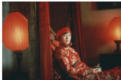
Still from Raise The Red Lantern (1991)