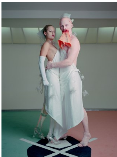
Still from Matthew Barney, CREMASTER 3 (2002)