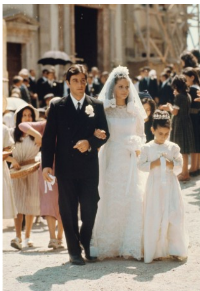
Film still from The Godfather (1972)