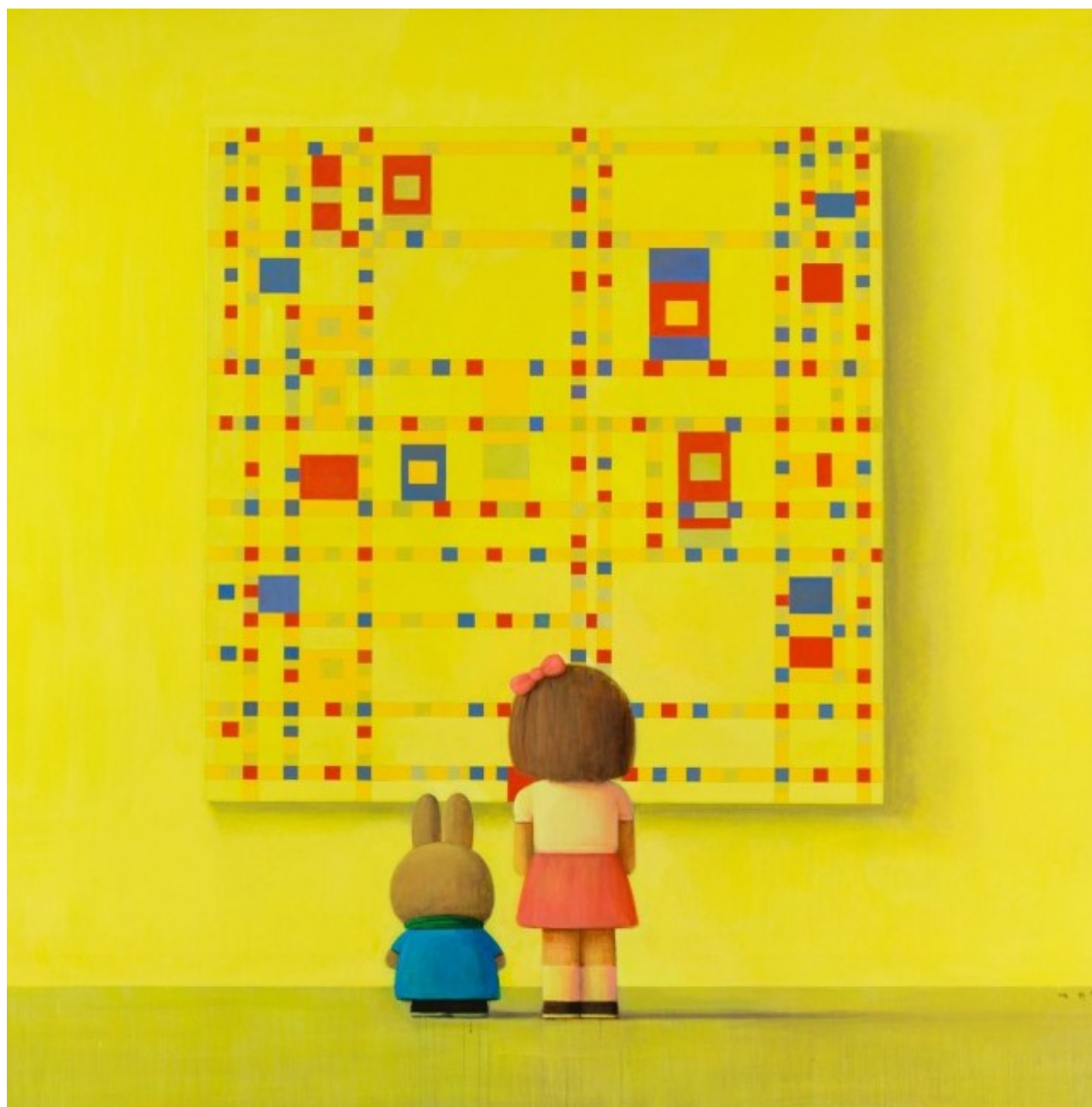
Liu Ye's The Past of Broadway (2006) is held in the collection of the soon to open He Art Museum in China.