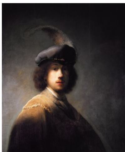
Rembrandt, Self-Portrait with Plumed Beret (1629)