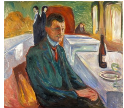
Edvard Munch, Self-Portrait with a Bottle of Wine/Self-Portrait in Weimar (1906)