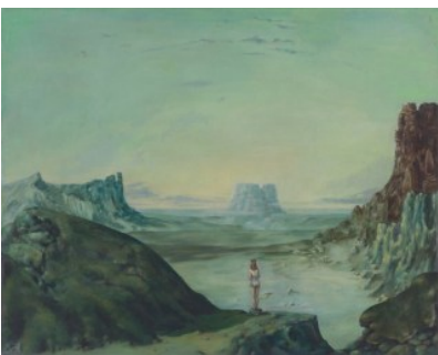
Dorothea Tanning, Self-Portrait (1944)