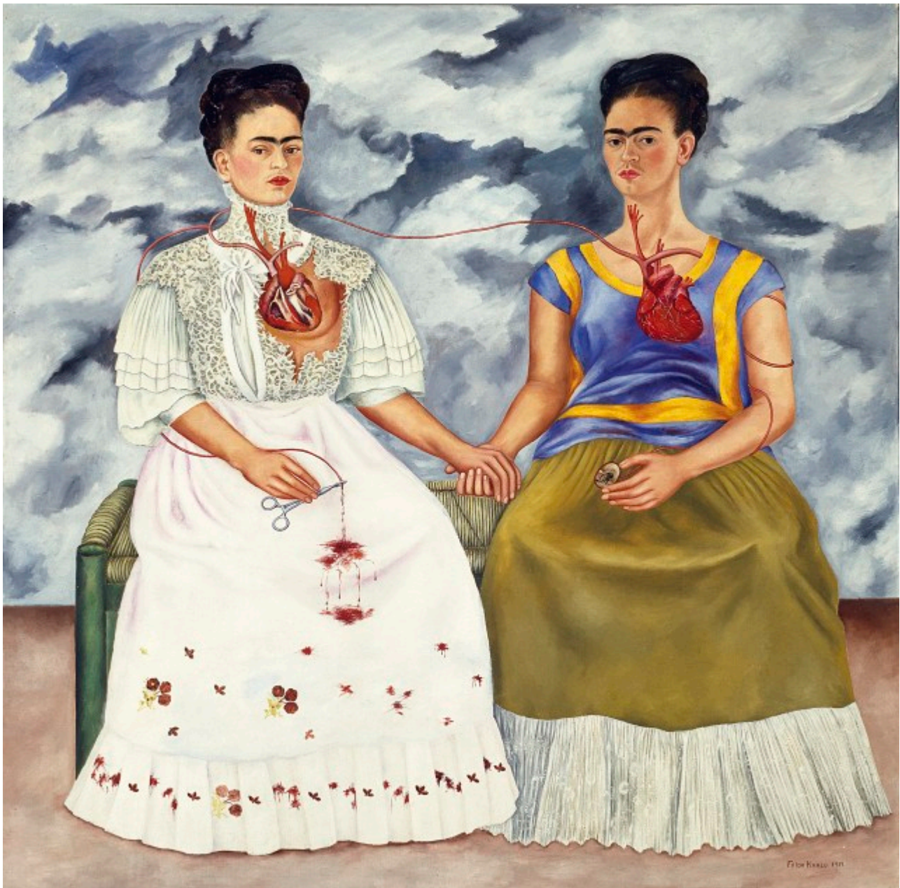
Frida Kahlo, The Two Fridas (1939)