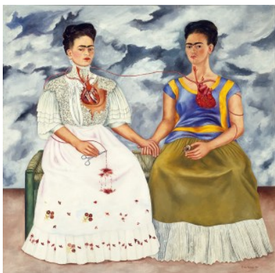
Frida Kahlo, The Two Fridas (1939)