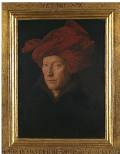
Jan van Eyck, Portrait of a Man (Self-Portrait?) (1433)