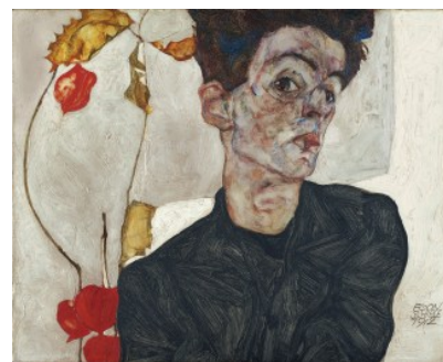
Egon Schiele, Self Portrait with Physalis (1912)