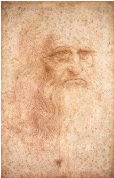
Leonardo da Vinci, Portrait of Man in Red Chalk (c.1512)