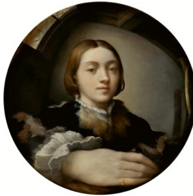
Parmigianino, Self-Portrait in a Convex Mirror (c.1524)