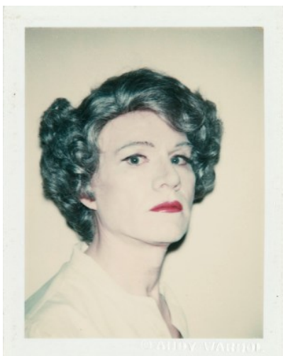
Andy Warhol, Self-Portrait in Drag (1980/81)