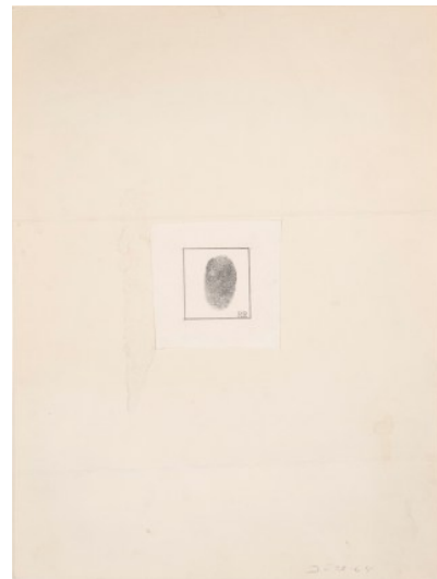
Robert Rauschenberg, Self-Portrait [for The New Yorker profile] (1964)