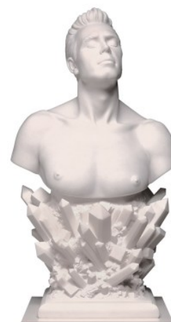
Jeff Koons, Self-Portrait (1991)