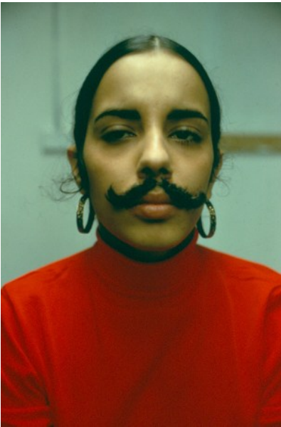
Ana Mendieta, Untitled (Facial Hair Transplants) , detail (1972; estate print 1977)