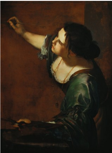
Artemisia Gentileschi, Self-Portrait as the Allegory of Painting (1638-39)