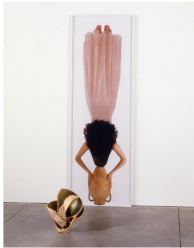
Janine Antoni, Caryatid (Terra cotta amphora) (2003)