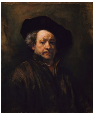
Rembrandt, Self-Portrait (1660)