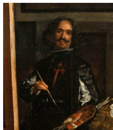
Diego Velazquez, Las Meninas , detail (1656)