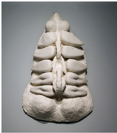
Louise Bourgeois, Torso: Self-Portrait (c.1963-64)