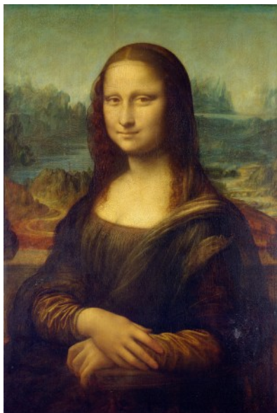
Leonardo da Vinci, Mona Lisa (1503)