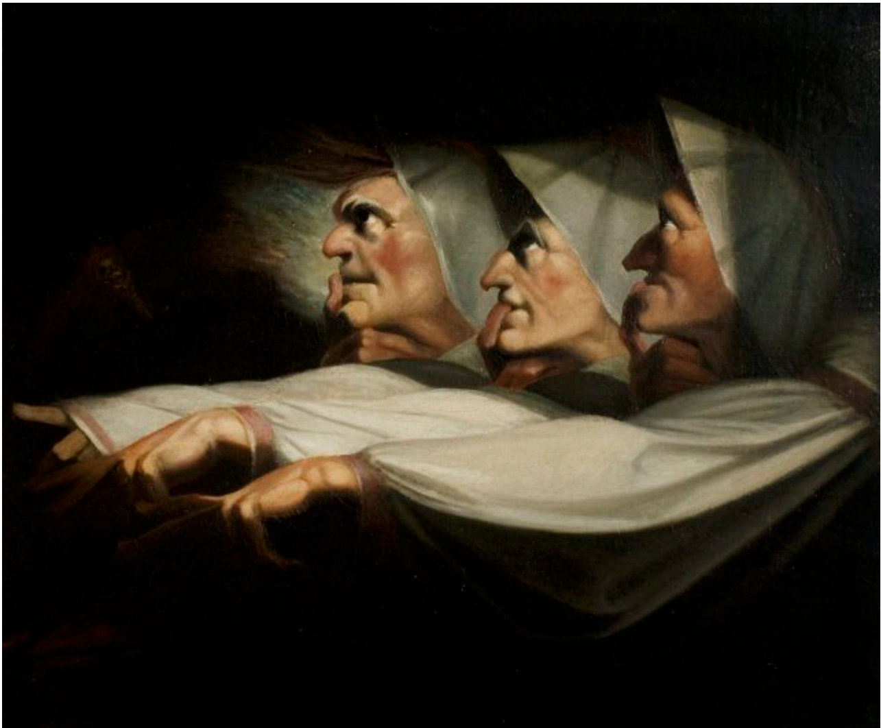
A work by "proto-Surrealist" artist Henry Fuseli: The Weird Sisters, Macbeth (c. 1783).